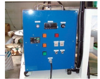
Single magnetizing current output type