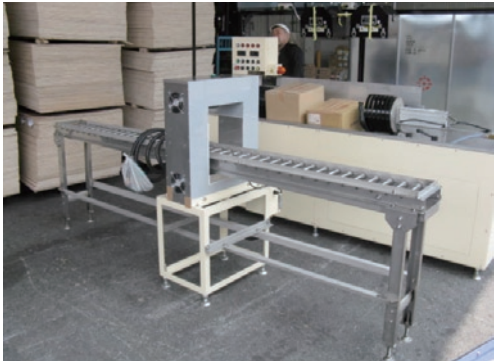
Through coil method